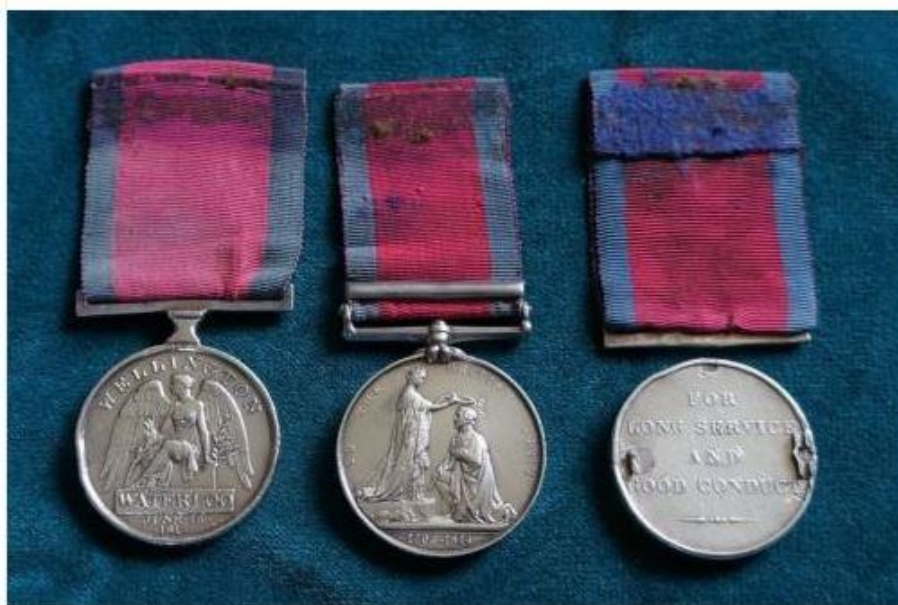
Waterloo, Peninsular, and Long service and Good conduct Medals